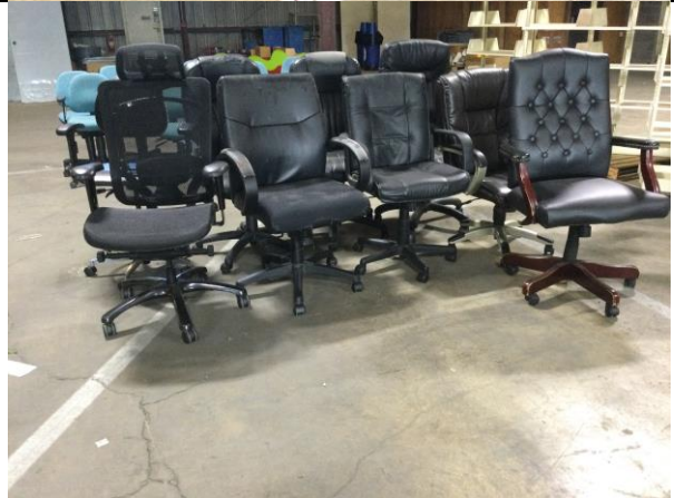
Lot Q- Blue Cloth Chairs