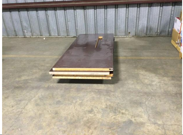
Lot ZZ- Elections Equipment