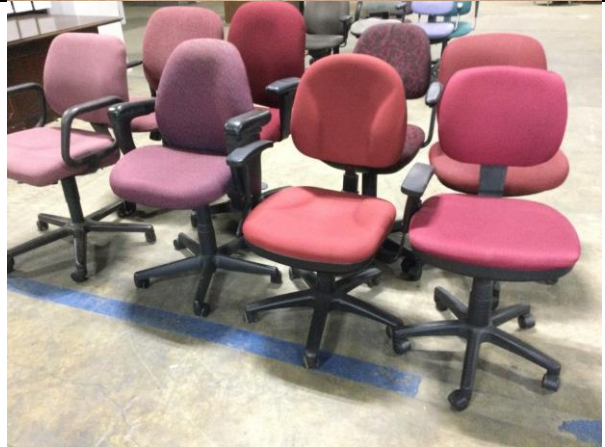
Lot T- Assorted Office Chairs