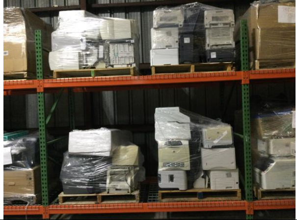
Lot RR- Assorted Electronics