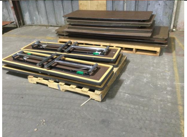
Lot UU- Systems Furniture