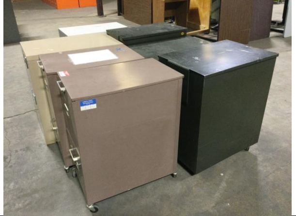
Lot BB- Short Black Lateral Cabinets