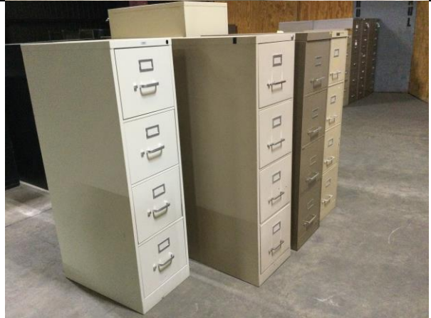
Lot FF- Light Gray File Cabinets