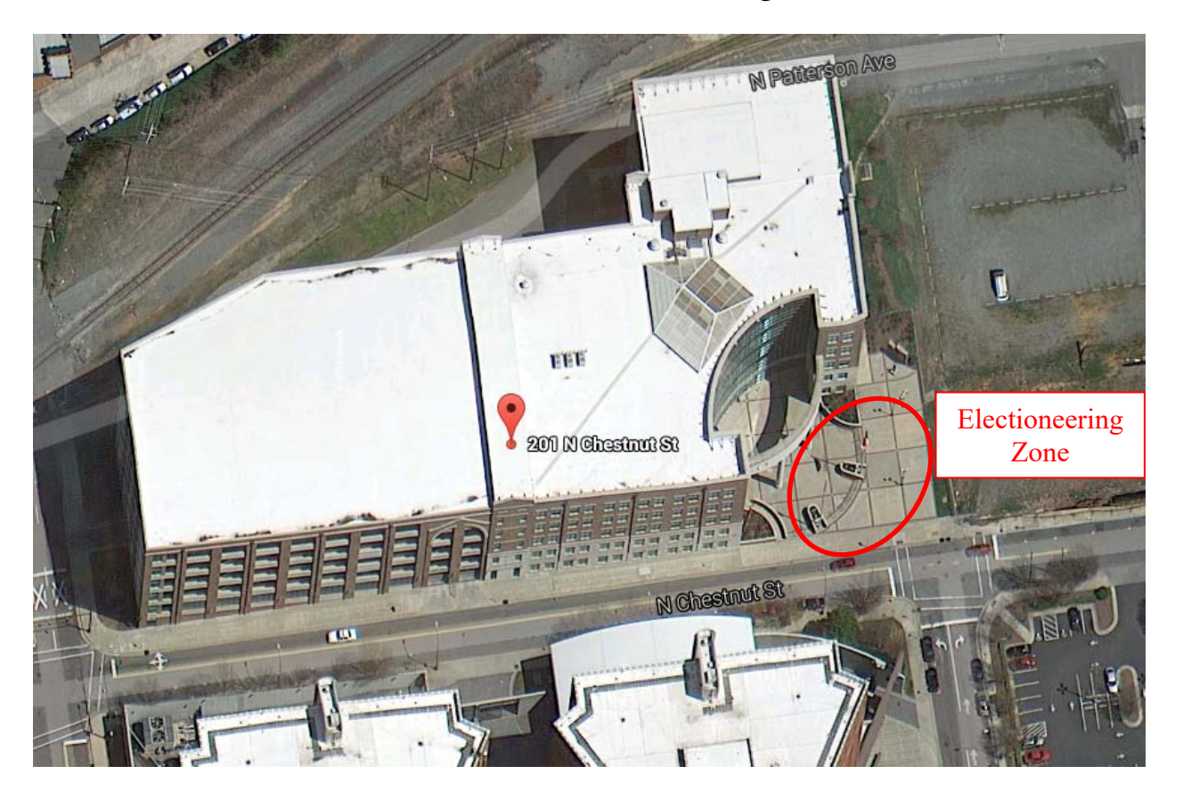
Forsyth County Government Center Building- front