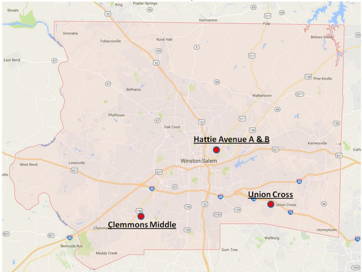
Figure 1 - Forsyth County Monitor Locations