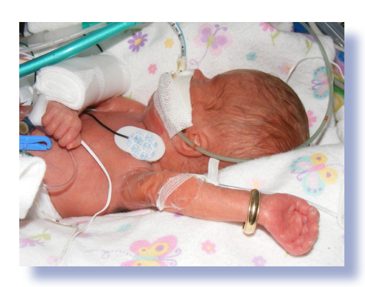
Notice the father's wedding band on the wrist of this extremely premature baby girl.